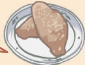
I ordered Curry Chanko today!