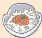
Whitebait w/salmon roe